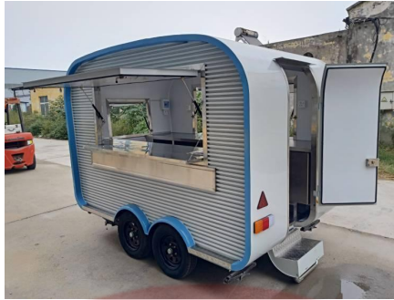
- Side -