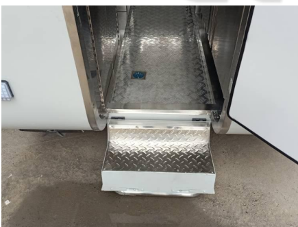
- Trailer Step -