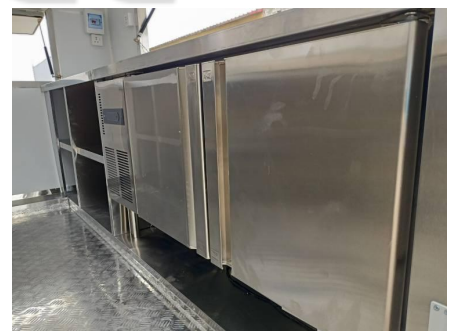
- Fridge -