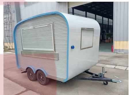
- Side -