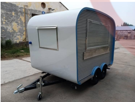
- Side -