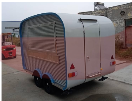
- Side -