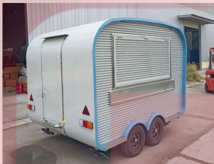
- Side -