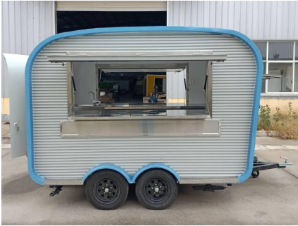
- Front -