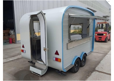
- Door -