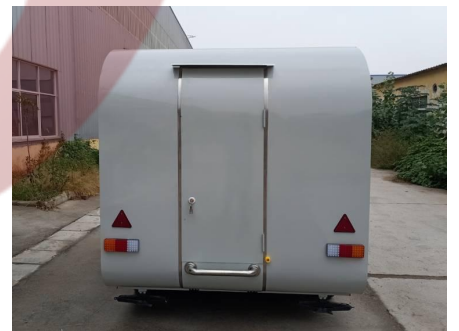
- Tail Lights -