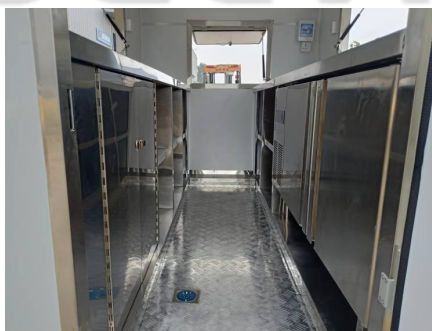
- Interior -